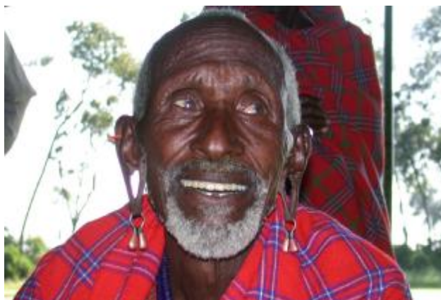
The smile of a man who has just regained his sight after many years of blindness

Many patients benefited from our outreach activities and 462 had sight restoring cataract surgery.