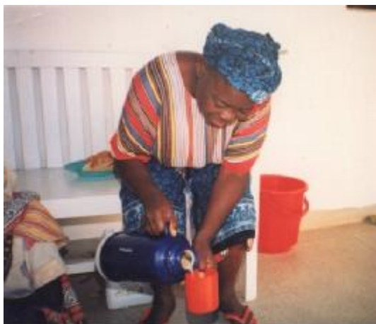
Here we see her making tea during training at the Eye Centre

But since she became blind, she sits in a corner, feeling useless and dejected.