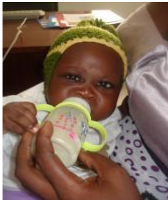
Beneficiary of Eye Give – child born with cataracts

Eye Give – A new fundraising project which, unlike some other distance giving plans elsewhere, allows individuals to make donations for specific items or services to help patients at KDEC.