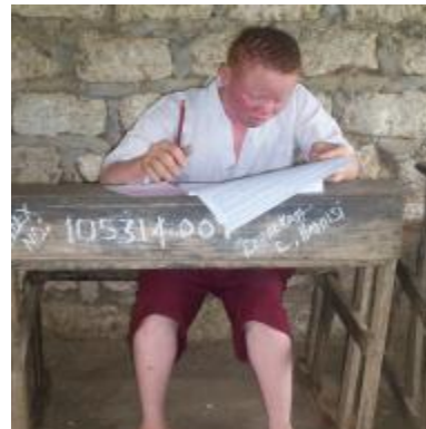
A boy with visual disability prepares for exams

print for the first time in Kwale District.