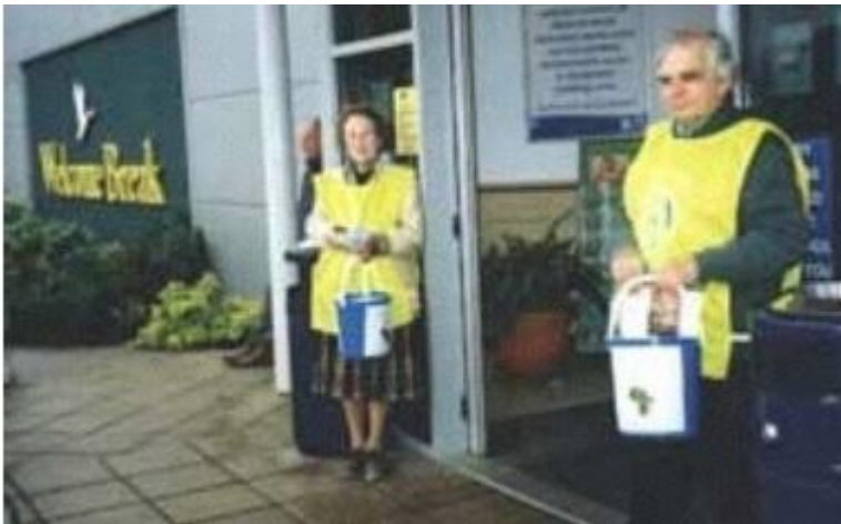
Collecting at the service station.

collected over 270 pounds in an hour, illustrating the generosity of the many motorists calling at the service station.