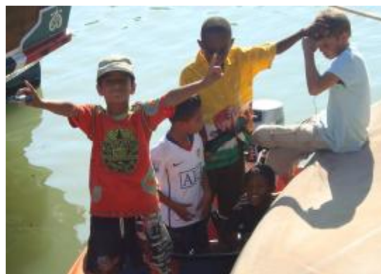
Young participants take to sea to compete

The annual fishing event took place in November on the coast North of Mombasa raising Ksh365,950/- (US$4,880)