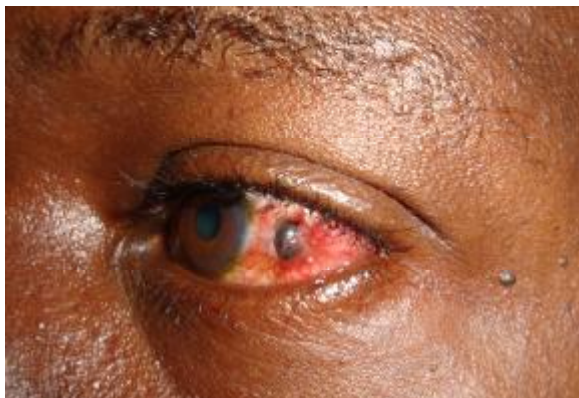
HIV/AIDS Related eye disease

Another example of local support is the Kijani Trust. This raises money by inviting opera companies from abroad to hold productions across Kenya. Part of the income was given to us to treat HIV/AIDS related eye diseases.