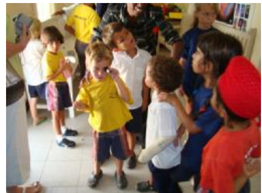
Pupils from South Coast Academy sampling the assistive devices on their visit to the Centre