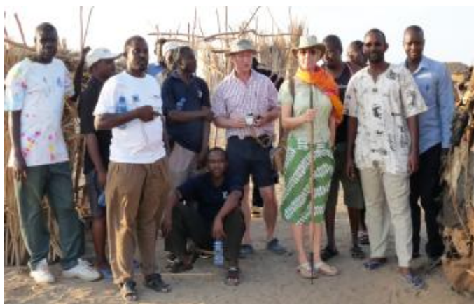
The team take a breather between surgery and explore in North Horr.