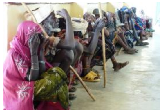
Patients waiting for surgery

We returned to the remote location of North Horr in northern Kenya again this year to carry out an eye camp, sponsored by the UK charity, Medical and Education Aid to Kenya (MEAK).