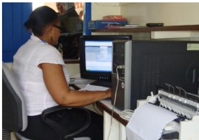
Patient being registered in at the reception using the new database system

KDEC has introduced a new management information system reducing manual work , providing more responsive management practices and enhancing service delivery to patients