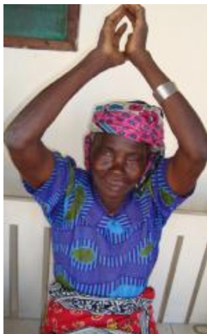
This lady shows the joy she feels now that she can see

As anticipated, the global economic crisis has had a direct impact on the funding we have received. This meant that we have had to reduce the level of service which we can provide to the community. In the field we saw almost 4,000 fewer patients compared with last year. Nevertheless, our work of restoring sight continues.